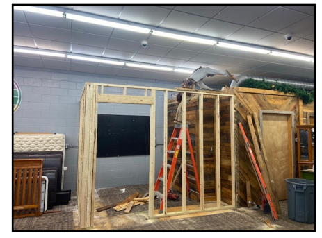
Harsin Built Construction built our community office.

In order to provide more services to our patrons, we added an additional office space in our building.